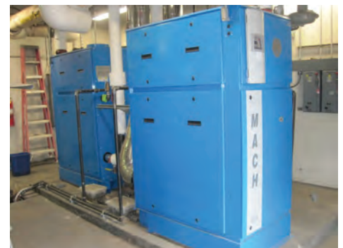
After: Two new condensing boilers have same footprint as one of the old units.