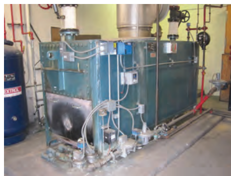
Before: One of the existing atmospheric boilers.

Enovity prepared a report for PerkinElmer outlining the recommended project that would reduce energy consumption, utility costs, and greenhouse gas emissions. The project consisted of replacing the two existing atmospheric hot water boilers with two new, high-efficiency condensing boilers. In conjunction with other modifications and controls upgrades to operate the system with lower hot water temperatures, the new boilers were estimated to have a combustion efficiency of 90% or better. The incentive provided by the Boiler Efficiency Program reduced the projects payback period from 3.6 years to 2.7 years.